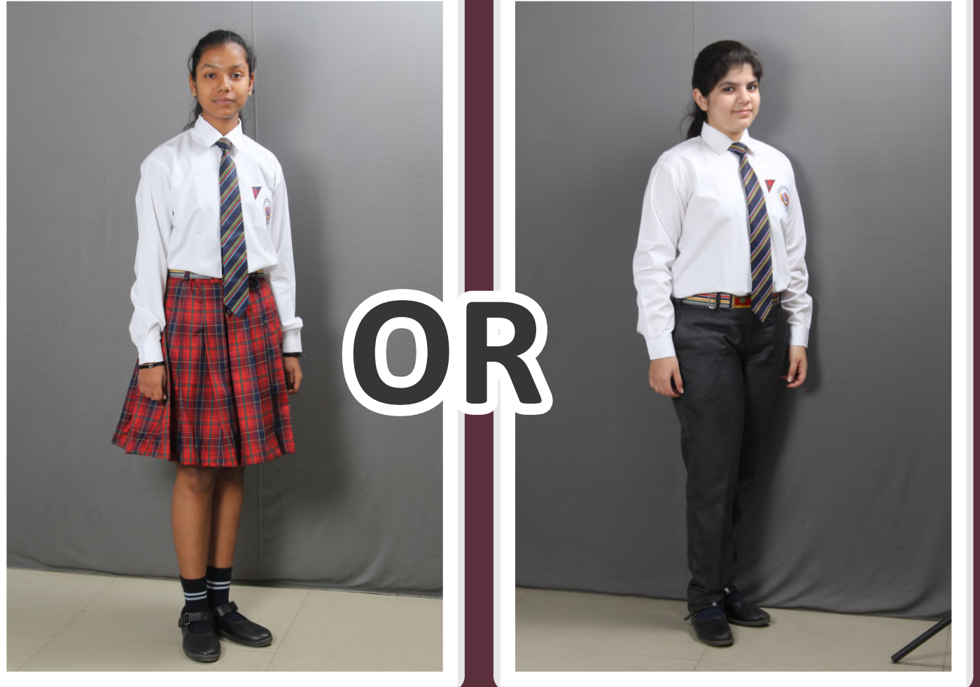
Note : Shade of trouser is Mafatlal Polar (550009) Note : Girls will wear divided skirts.