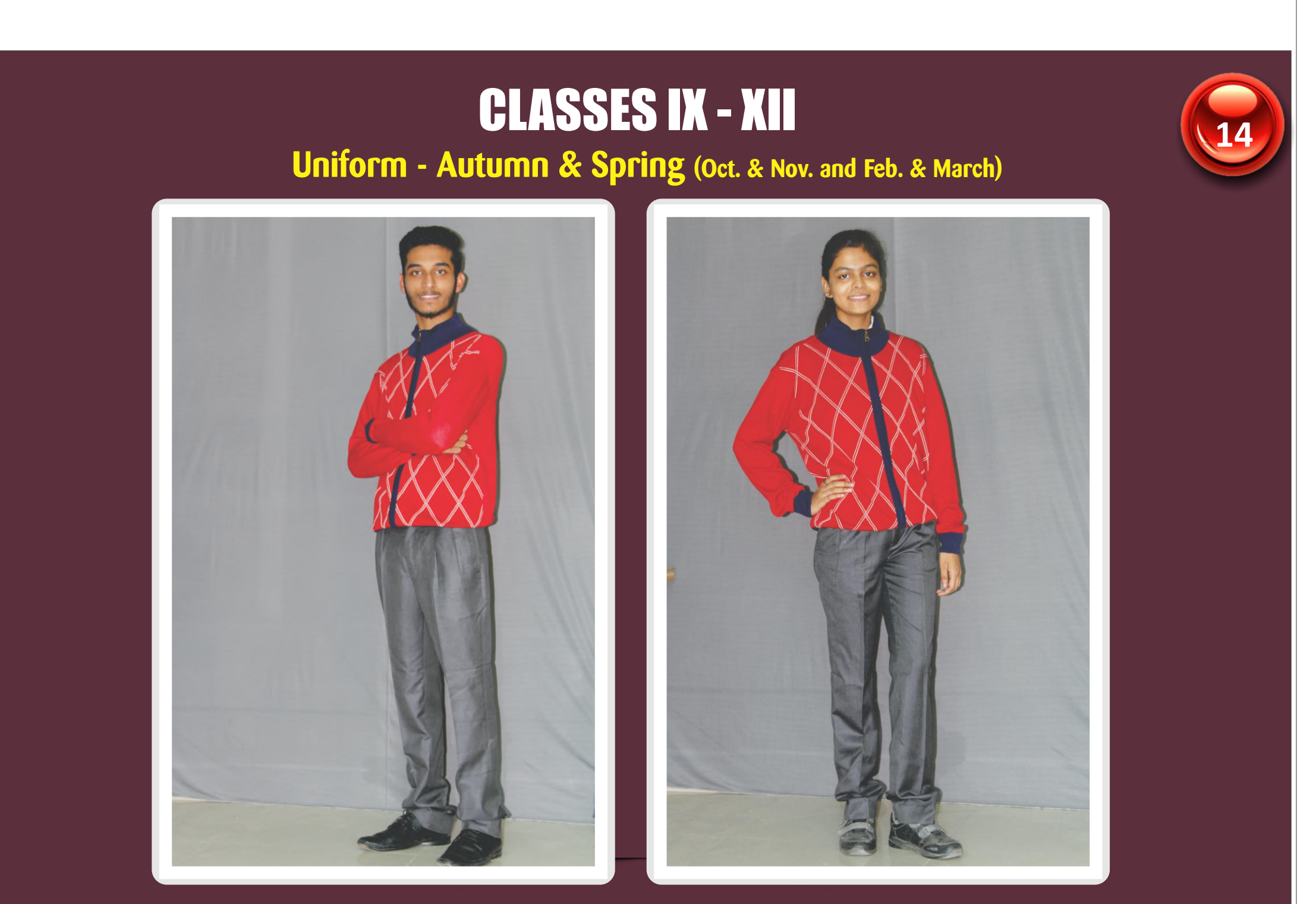
Note : Shade of trouser is Mafatlal Polar (550009)

CLASSES IX - XII Wednesday & Saturday Uniform - Autumn & Spring (Oct. & Nov. and Feb. & March)