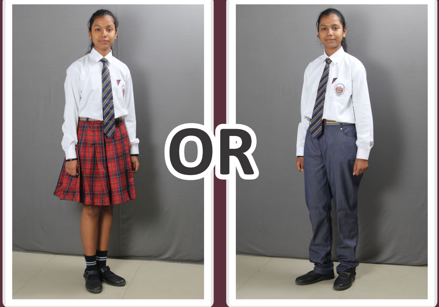
Note : Girls will wear divided skirts.