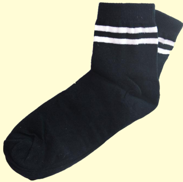
Socks (Nursery to Class XII)