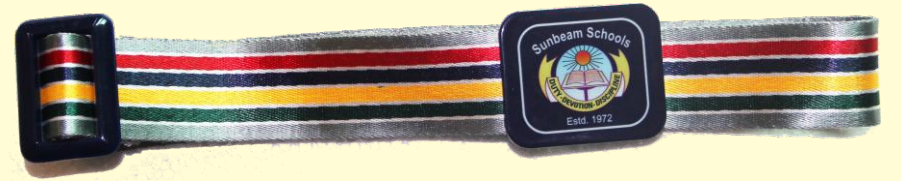
Belt (classes VI - XII)

NOTE Parents are free to buy Uniform / Accessories / Shoes from any shop / outlet of their convenience from anywhere in the city.