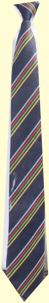
Tie (classes VI - XII)